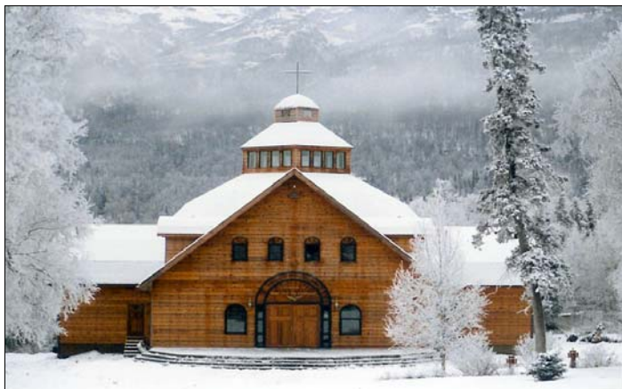
Saint John the Evangelist Cathedral Eagle River, Alaska

is the lens through which everything outside of us passes to become the reality we see in our heart. The story of my spiritual ancestry helps to illumine the journey of my family from England, to Kentucky, to Alaska.