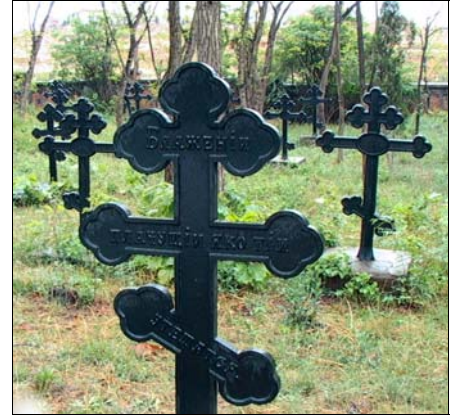
Russian Cemetery in Port Arthur, China