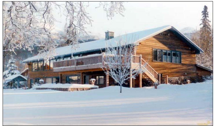
Saint James House